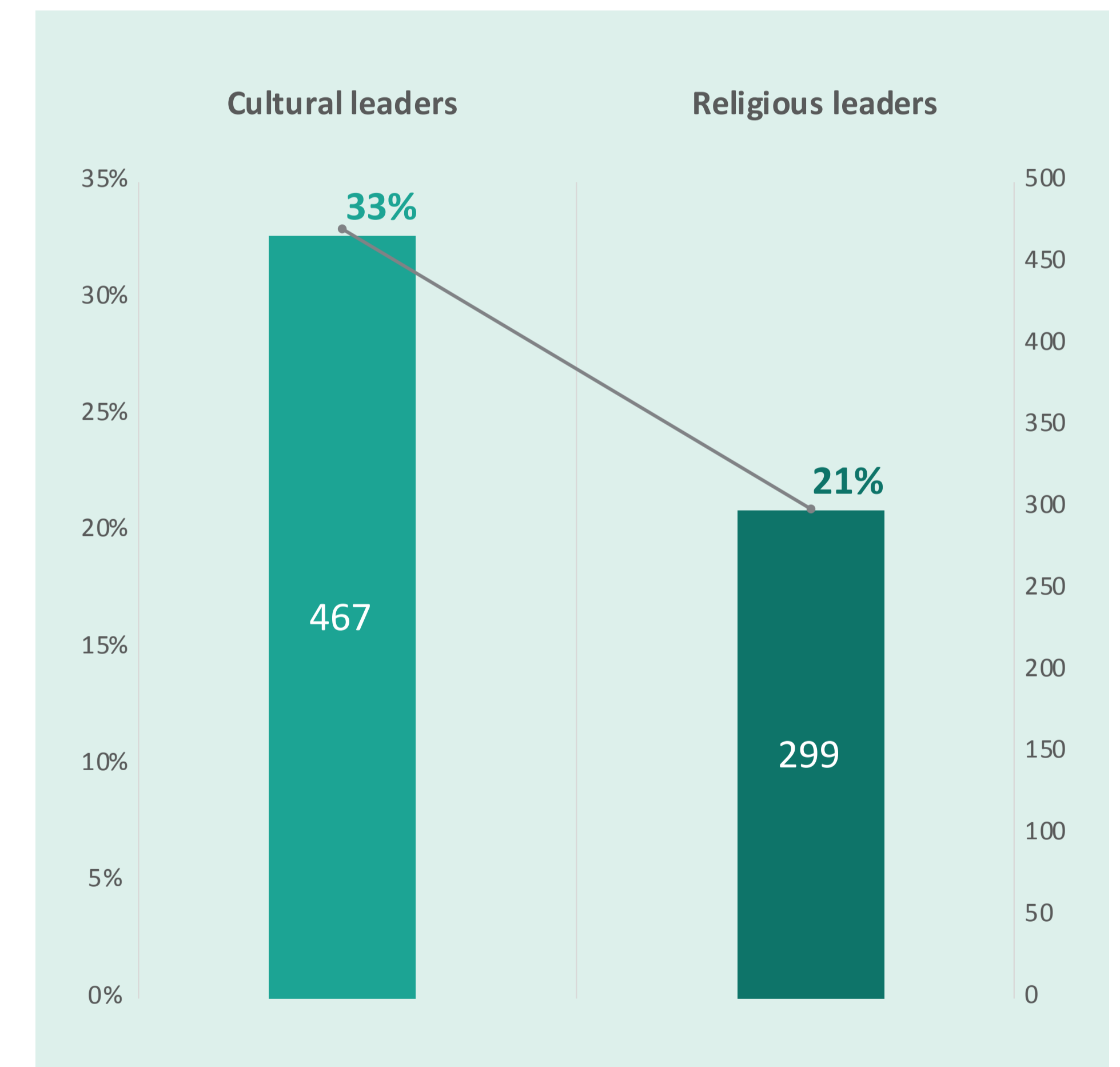
Figure 3. People who viewed local actors as important sources of SMC information